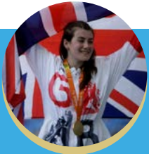
Hollie Arnold Para Athletics